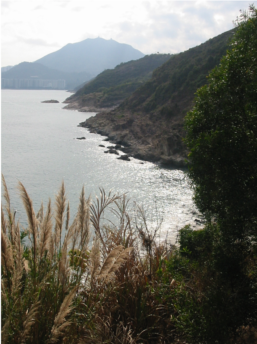
Plate 1 Stretch of Natural Shoreline at Tseung Kwan O to be affected by the Proposed Project

香港地貌岩石保育協會 Association for Geoconservation, Hong Kong