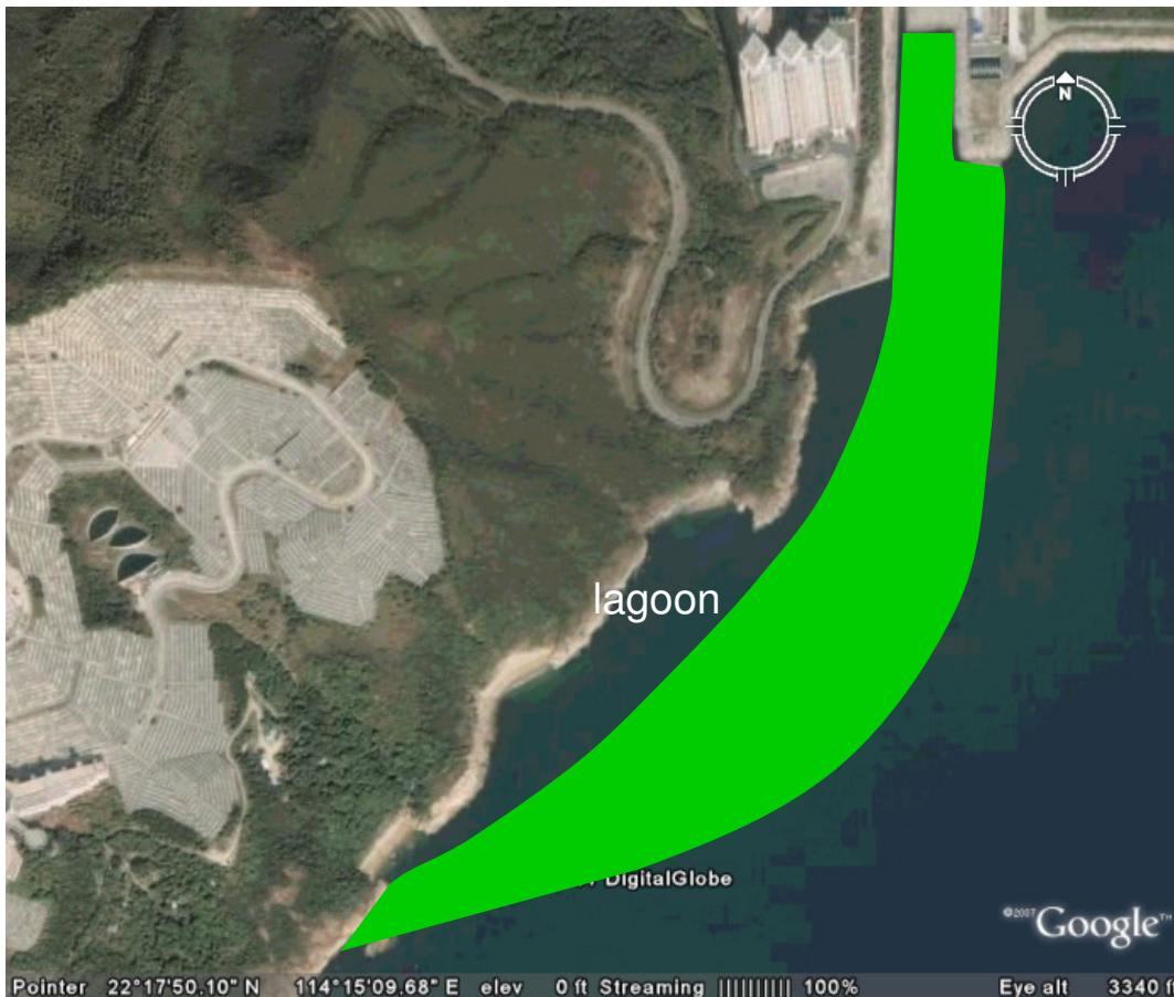
Diagram 3 AGHK Proposed Reclamation Concept